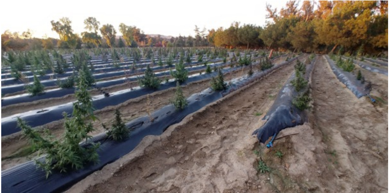
Planted: mid-October; photo taken: 12/26