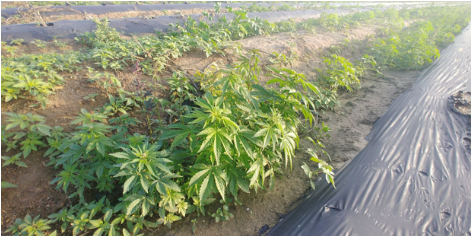
Volunteer Hemp; photo taken: 1/11