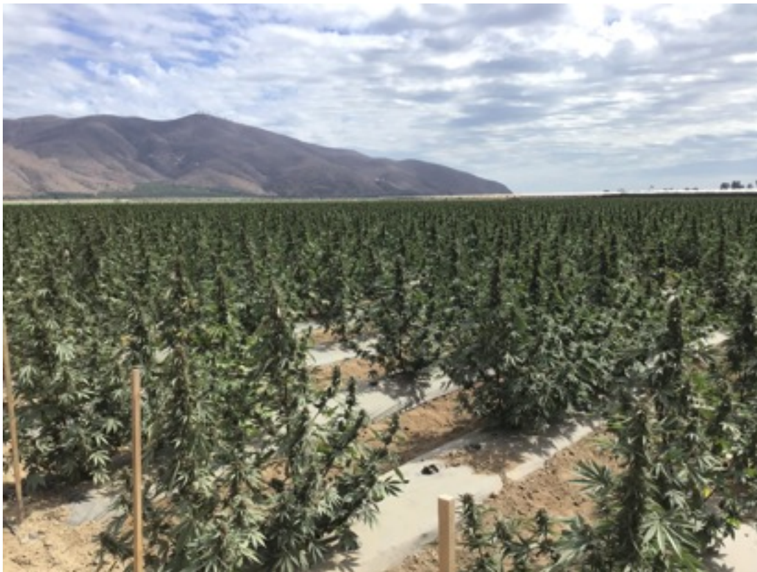
Planted: early-August; photo 10/2